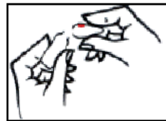
3. Opening away from the operator, apply quick even pressure with the thumbs to snap the ampoule neck.