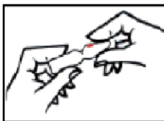
2. Position thumbs on the head and body of the ampoule on the opposite side to the dot.